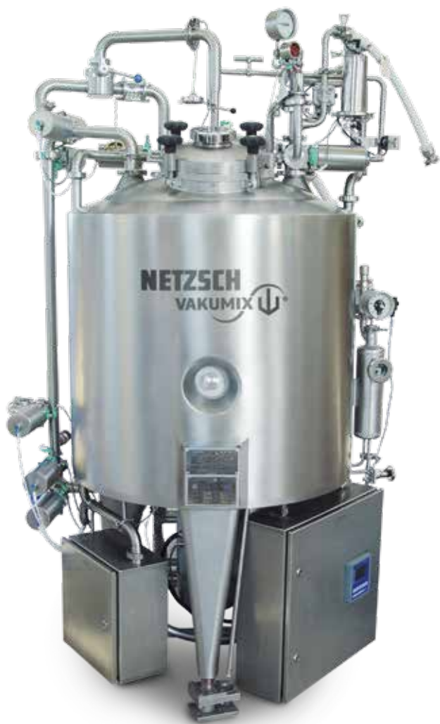
GAMMAVITA® 140 – with Load cells