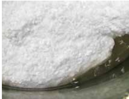
Melting of wax pellets