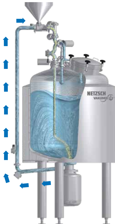
Mixing via circulation line and induction of powder