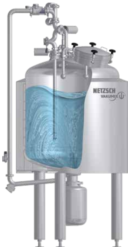
Mixing inside the tank