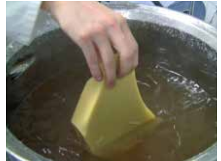
Melting of wax blocks