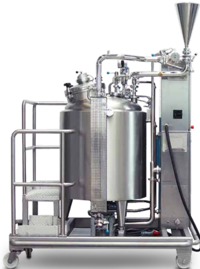
GAMMAVITA® 275 – mobile with work platform

All GAMMAVITA® models are optionally available with top driven stirrers, like the NETZSCH Vakumix Easy Visco.