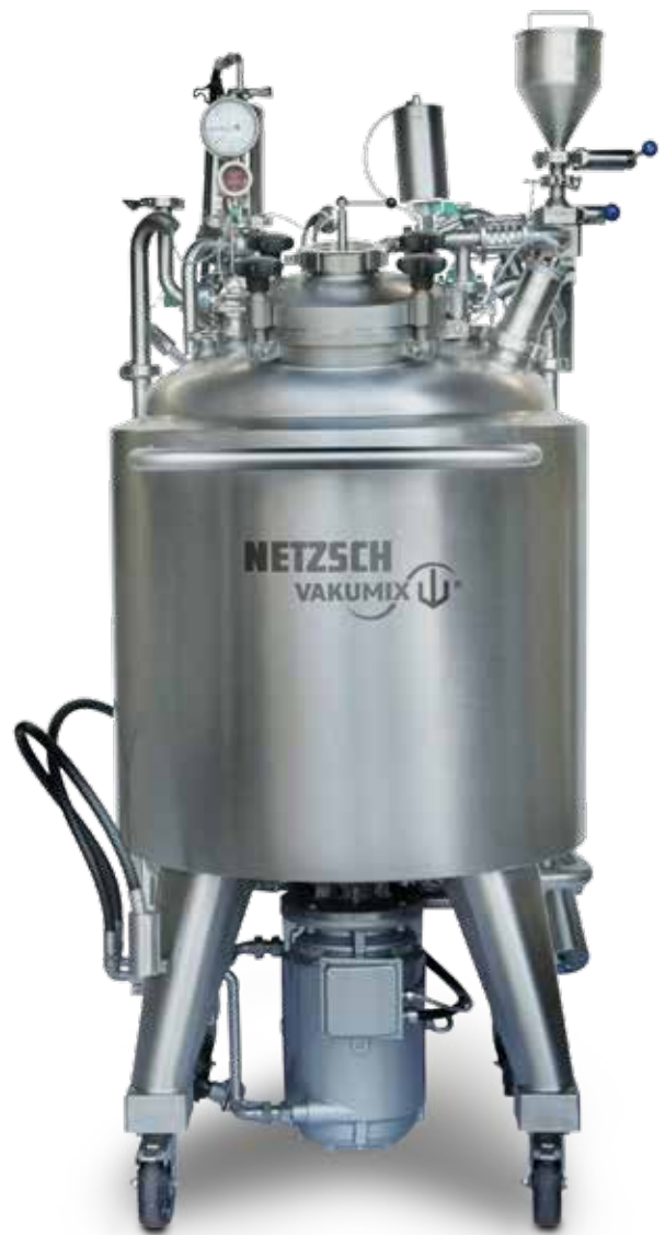
GAMMAVITA® 300 – mobile