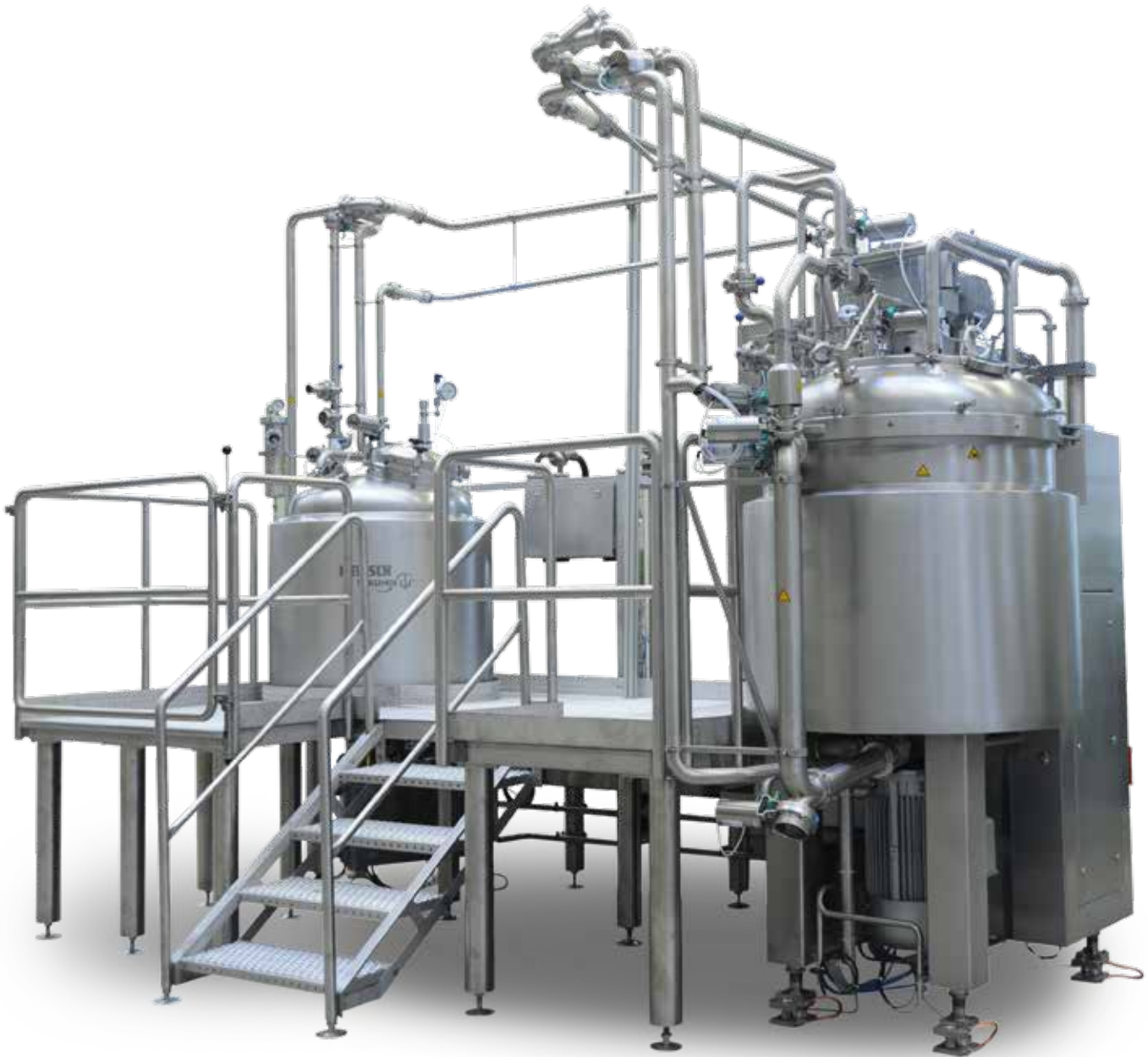
KAPPAVITA ® HM 500 homogenizing mixer with GAMMAVITA ® 500 phase tank