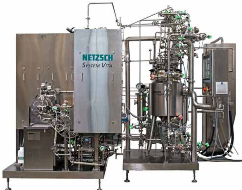
System VITA ® , consisting of a DELTAVITA ® 2000 agitator bead mill and a GAMMAVITA ® 60 batch tank