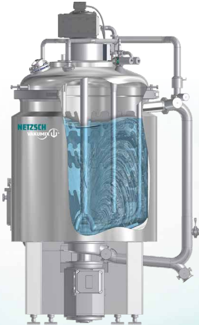
Schematic picture of KAPPAVITA ®