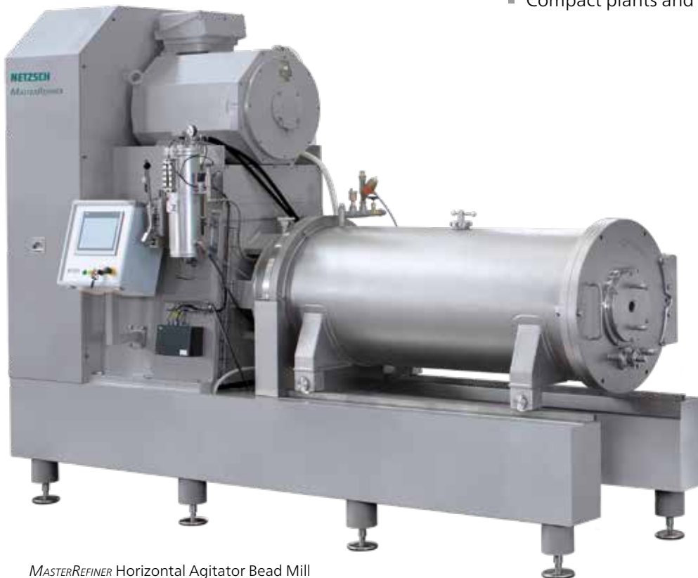
MASTERREFINER Horizontal Agitator Bead Mill