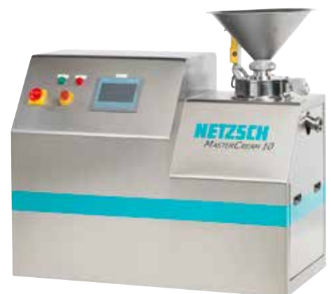
NETZSCH MASTERCREAM with Control Unit