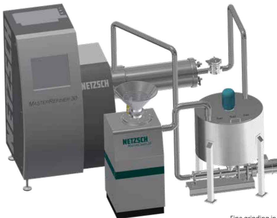
Fine grinding in continuous operation with the MASTERREFINER agitator bead mill

First, the production capacity of a plant is dependent on the size of the MASTERREFINER agitator bead mill employed. Second, it is strongly dependent on the initial fineness of the sugar used. This correlation is shown in the table below.