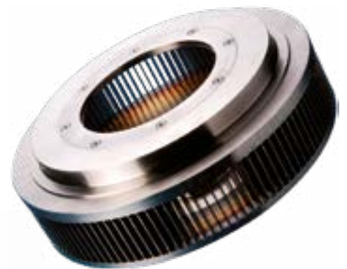
NETZSCH High Performance Fine Classifier INLINESTAR