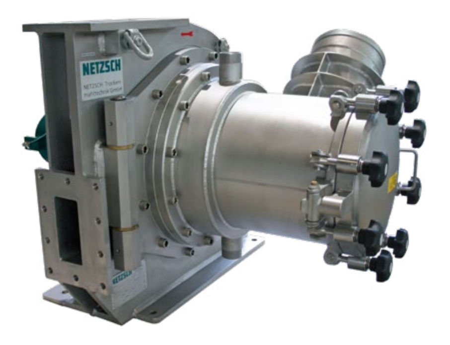
NETZSCH High Performance Fine Classifier InLineStar