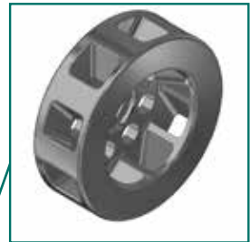
Dynamic separator rotor