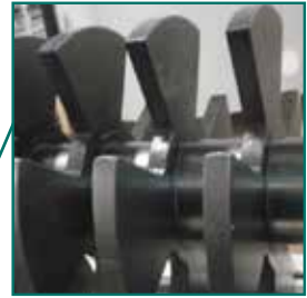
NEXWING® grinding disks