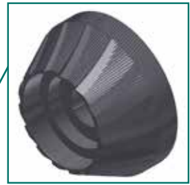
SAMBA® pre-crushing system