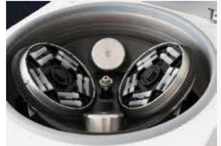
Sample holders for 2ml tubes