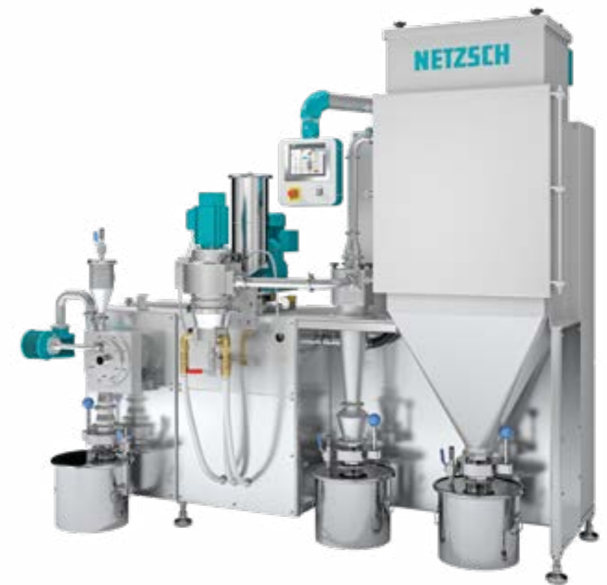
LABPILOTPLANT with hose filter in SMARTREMOVAL execution