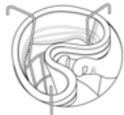
Dismounting of the filter hose with snap ring