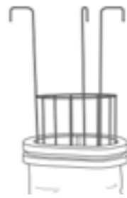
Dismounted unit (filter hose and support cage)