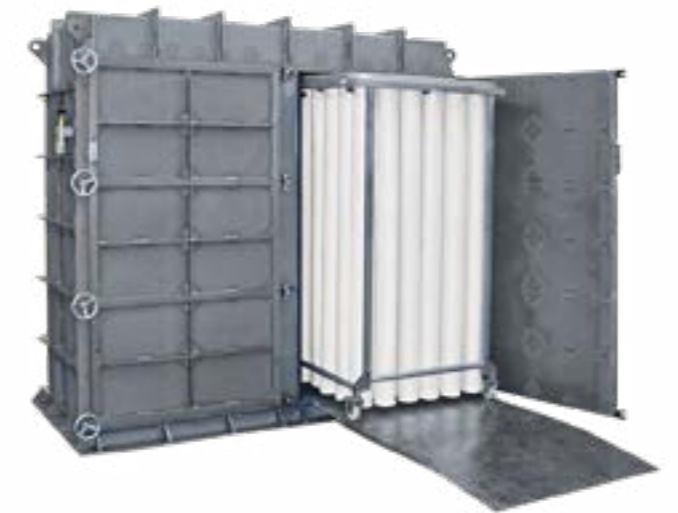
Rapid change filter with mobile carriage equipped with filter hoses

The use of filters with mobile carriages and filter elements is recommended if a particularly compact design is required.