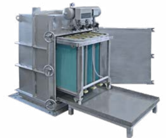
Rapid change filter with mobile carriage equipped with filter elements