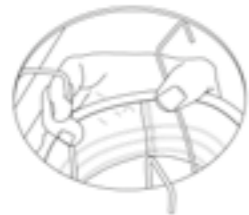
Hooking of the unit onto the perforated filter plate