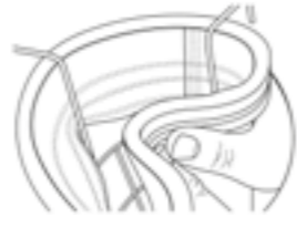
Mounting of the filter hose with snap ring