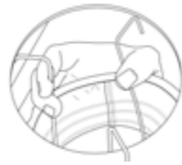
Unit is hooked off by pushing together the springs