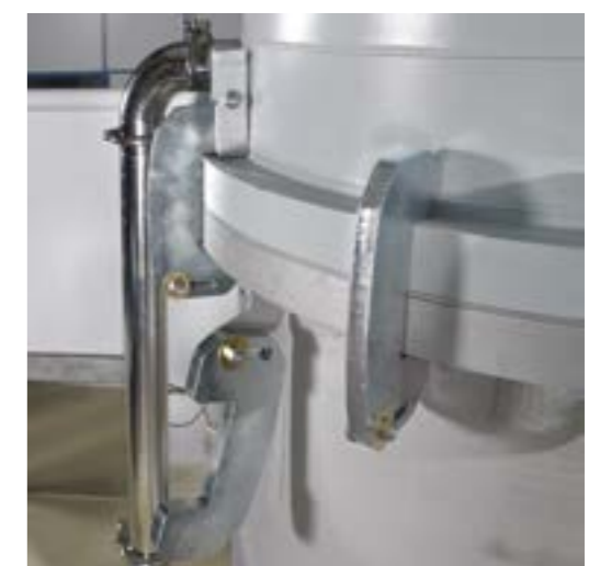
Easy loosening of clamping brackets without tools in relieved state

NETZSCH SMARTLOCK is used for the following applications: