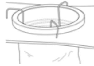
Mounting of unit completed