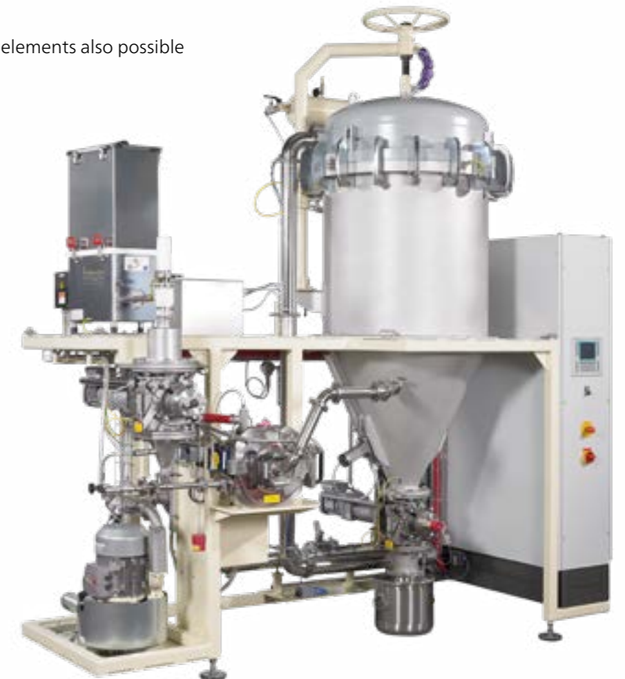
PILOTPLANT with High Density Bed Jet Mill CONJET ® 16 and Top Removal Hose Filter with Rapid Locking System SMARTLOCK