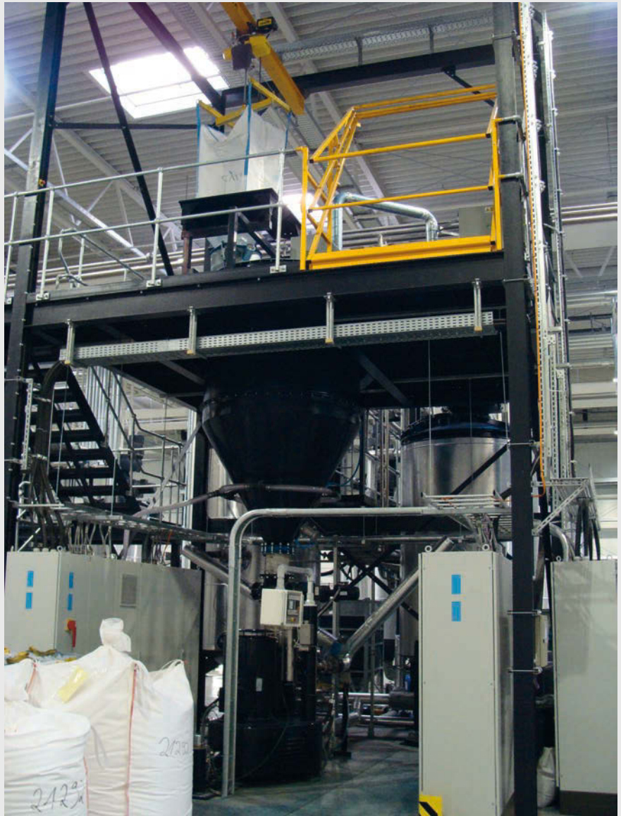
The revolutionary \Psi -Mix ® used in the plant, with a combination of vacuum dispersing, shearing and pressure wetting resulted in high productivity, with excellent results and total reproducible quality.

performance specifications the NETZSCH engineers focused on designing the best possible solutions – utilising both their own patented machinery, like the LME Horizontal Bead Mill and \Psi -Mix ® , as well as best-in class equipment from other vendors.