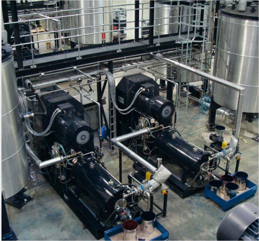
The LME Horizontal Bead Mills, with patented Dynamic Classifier System (DCC), provide increased throughput rates with virtually no blockage.

From site preparation through to commissioning and final plant inspection – This was a real turnkey solution NETZSCH provided. Some of the main elements of the project included, the design and construction of new PMD batch disperser technology, upgraded LME horizontal bead mills and the revolutionary \Psi -Mix ® . Mezzanine steel-work and bigbag lifting gantries; Hoists and cruciforms, big-bag and small-bag discharge units, process valves instrumentation, process pipe work with lagging, the complex electrical installation, product filters, transfer pumps, dust extraction system, fume extraction system, compressed air system, chilled water and heating system and many hundreds of smaller items.