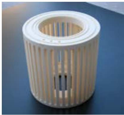
Aluminum oxide rotor