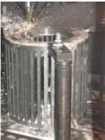
Tungsten carbide rotor