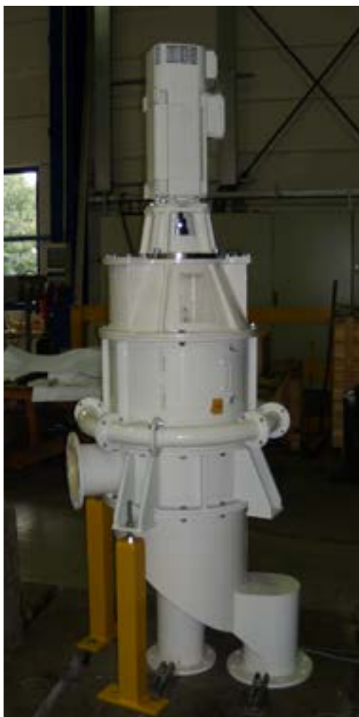
BORA 360 CD for quartz

The classifier rotor can be built in various ceramics and steel alloys depending on the application