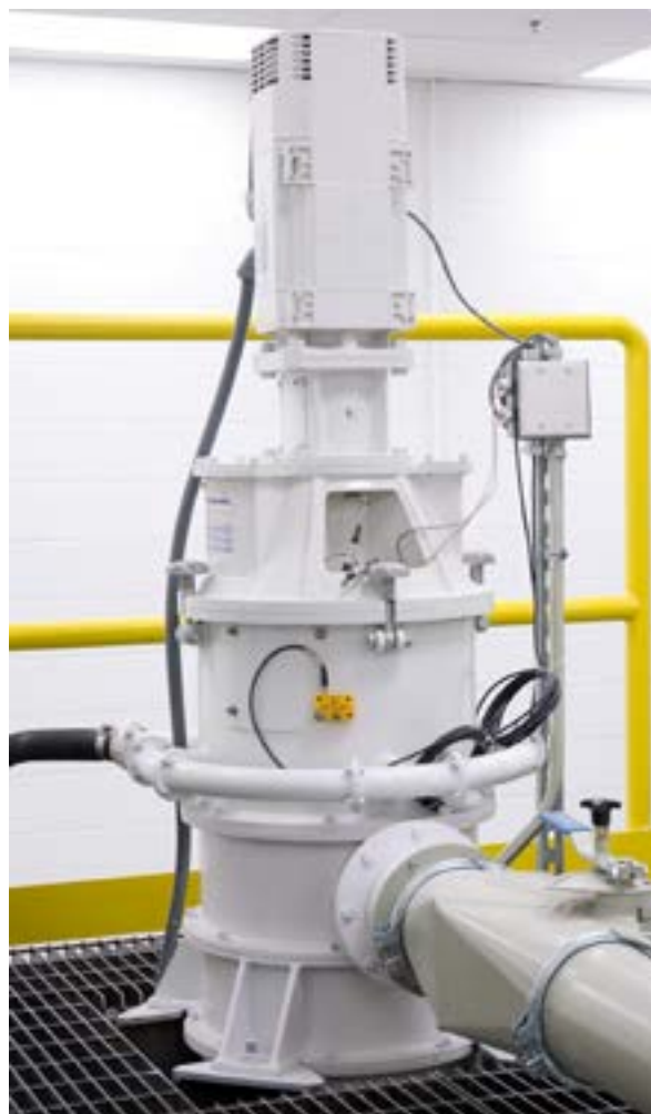
BORA 50 SD, d_{98} < 2 \mu\text{m}